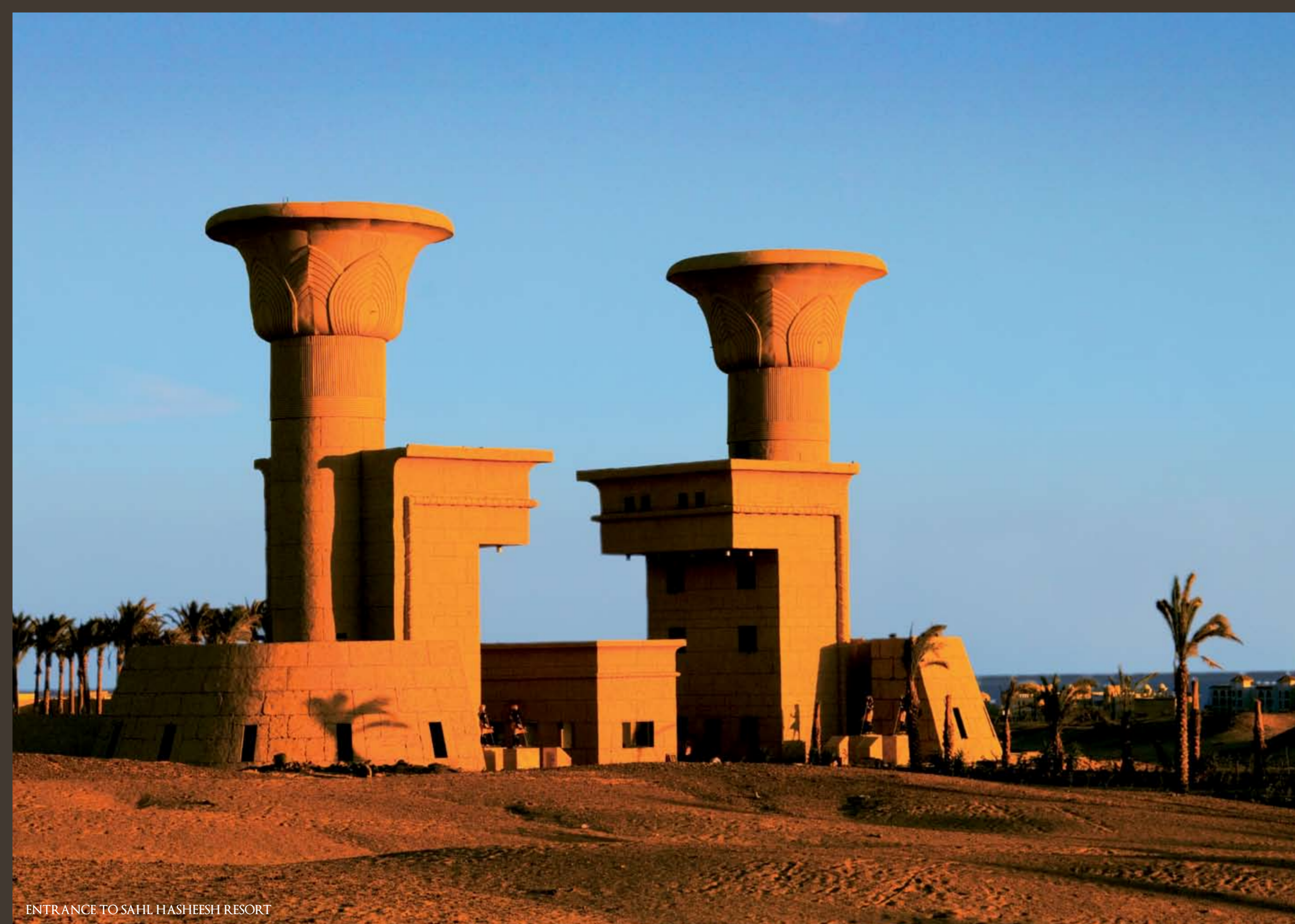
ENTRANCE TO SAHL HASHEESH RESORT